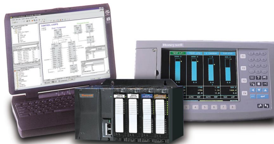
Figure 2: HC900 Hybrid Controller, Model 1042 OI and Hybrid Control Designer Software

Overview - The HC900 as shown in Figure 2 consists of a panel-mounted controller, available in 3 rack sizes along with remote I/O, connected to a dedicated Operator Interface (OI).